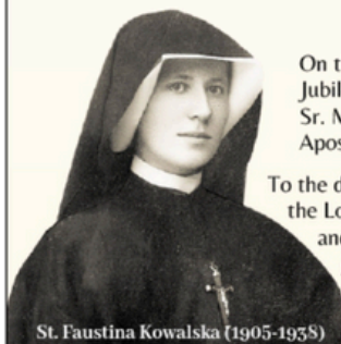
St. Faustina Kowalska (1905-1958)

On the first Sunday after Easter in the Great Jubilee of 2000, Pope St. John Paul II canonized Sr. Maria Faustina Kowalska, the Secretary and Apostle of Divine Mercy.